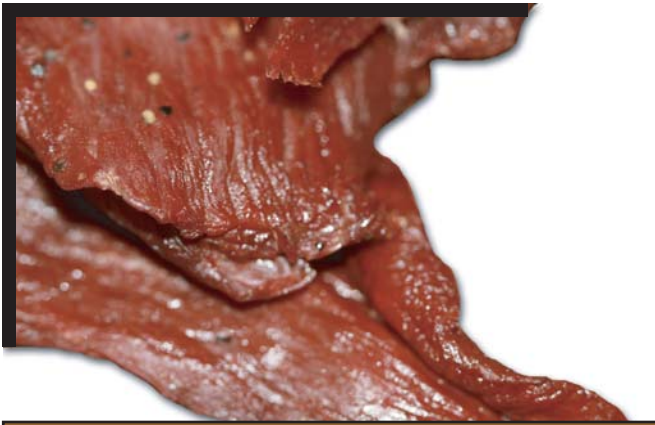
Jerky - Beef/Turkey Stix