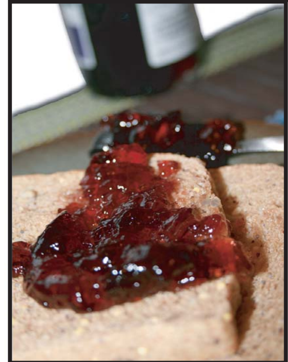
Jams & Jellies